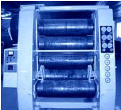
Figure 2 Five roll mill

Refining is the final grinding of all particles in the liquid chocolate together to produce an even extremely smooth texture in which no grit can be detected on one's tongue or pallet. This means the largest particles should be in the range of 15-30 micron. If the cocoa liquor has been properly ground, the purpose of refining is to reduce the size of added sugar crystals and, in the case of milk chocolate, the particles of milk powder.